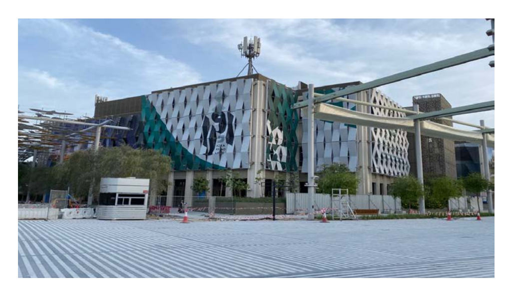
International Participants Meetings (IPM) OCI Pavilion