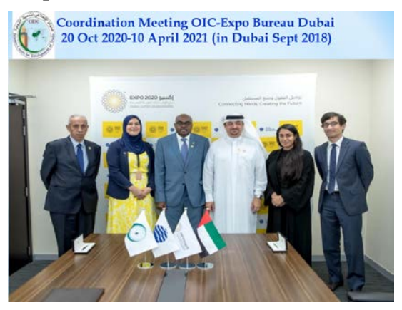
PREPARATORY MEETINGS WITH EXPO BUREAU DUBAI