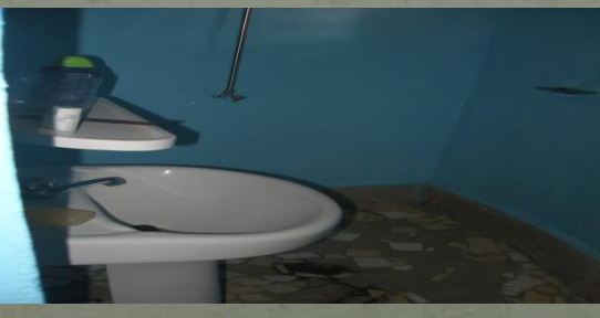
New huts constructed