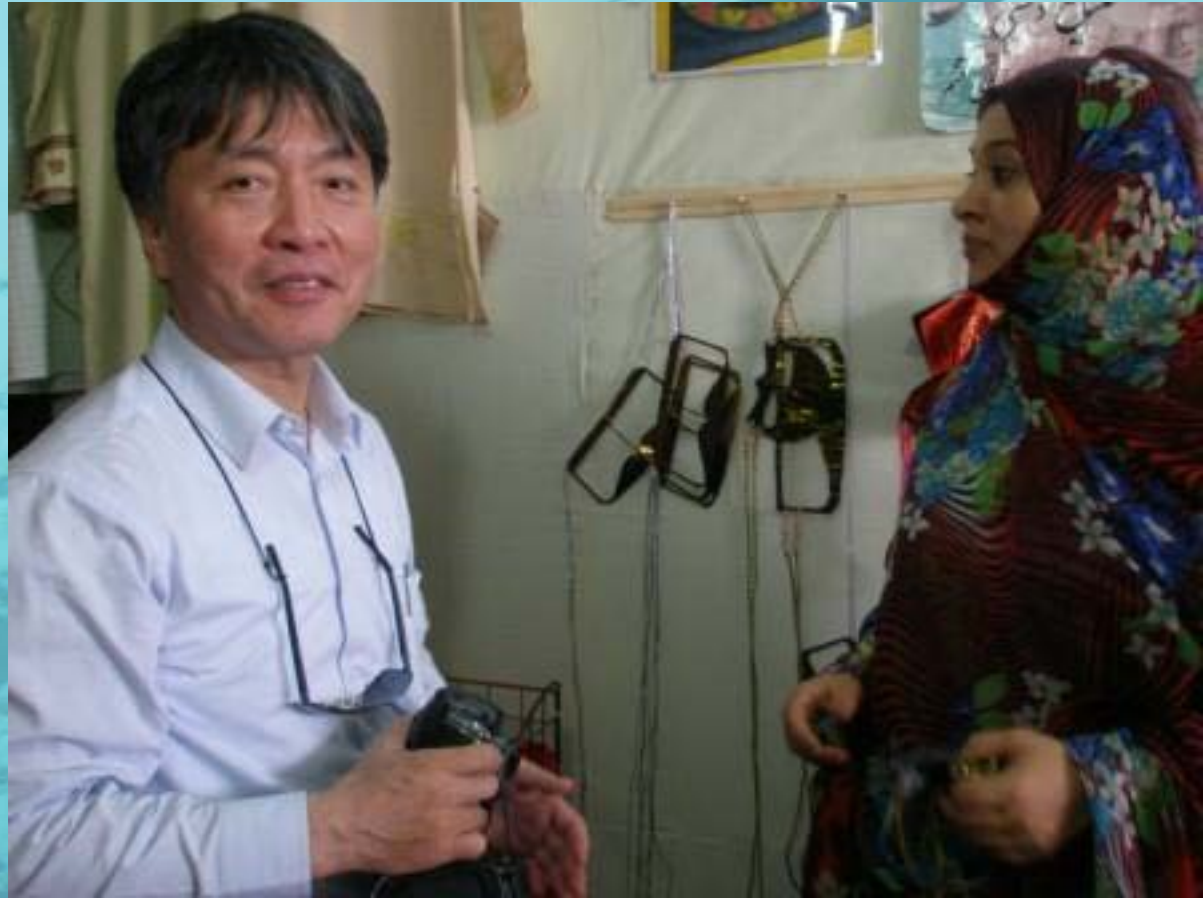
The regional chief of UNDP visited the project