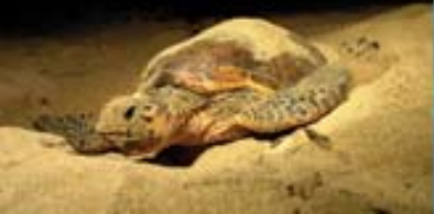
SHIBDERAZ TURTLES BEACH