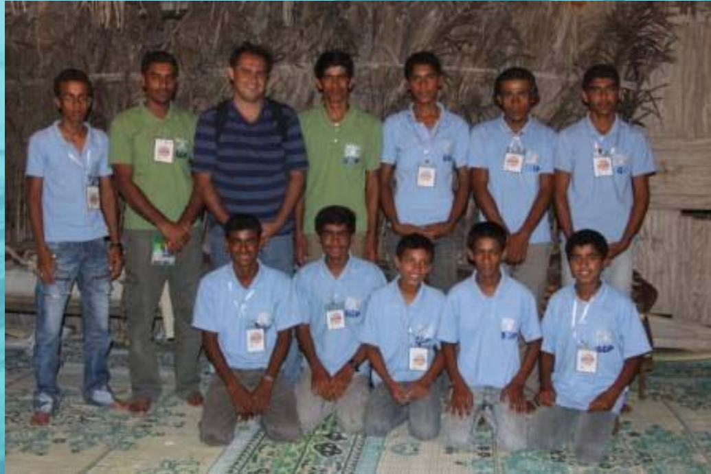
Local volunteers team