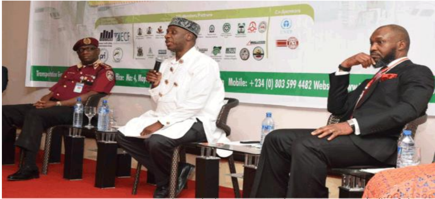
The Minister of Transportation, Rt. Hon. Rotimi Amechi with the Present and Past Corps Marshalls of the FRSC ( Boboye Oyeyemi and Osita Chidoka ) at a programme on the 24 th of October 2016