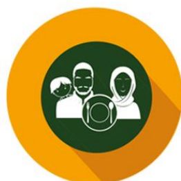
Special Restaurant for Families