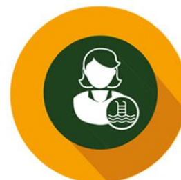
Private Beach & Pool for Ladies