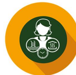
Private Pool & Sauna for Ladies only hours