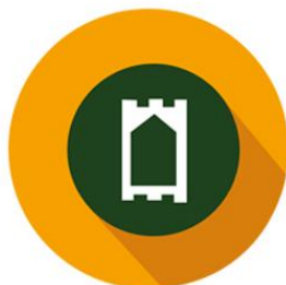
Prayer Rug in Rooms