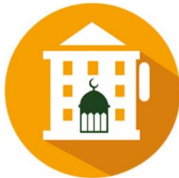
Masjid in Hotel