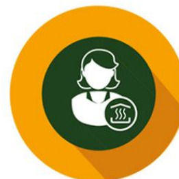
Private Bath & Sauna for Ladies