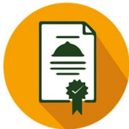
Halal Certificate Kitchen