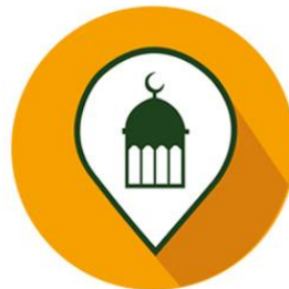
Nearby Mosque or masjid