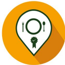
Halal Food in & Nearby Hotel