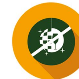
No Disco & Bar