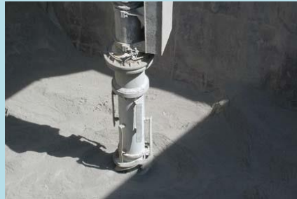
CEMENT & CLINKER