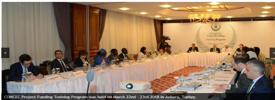
COMCEC Project Funding Training Program was held on March 22nd - 23rd 2018 in Ankara, Turkey.

COMCEC Project Funding (CPF) is a financing mechanism introduced by the COMCEC Coordination Office (CCO) in 2013. It finances projects submitted by the Member Countries and relevant OIC Institutions to realize the strategic objectives and outcomes of the COMCEC Strategy. CPF aims at realization of policy recommendations adopted by COMCEC Ministerial Sessions, enhancing solidarity and multilateral cooperation among Member Countries as well as increasing institutional and human capacity in those countries.