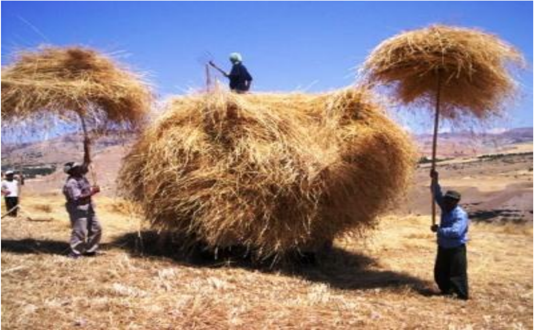
Laying of the harvested wheats on a carrier by hayforks and wooden winnowing forks