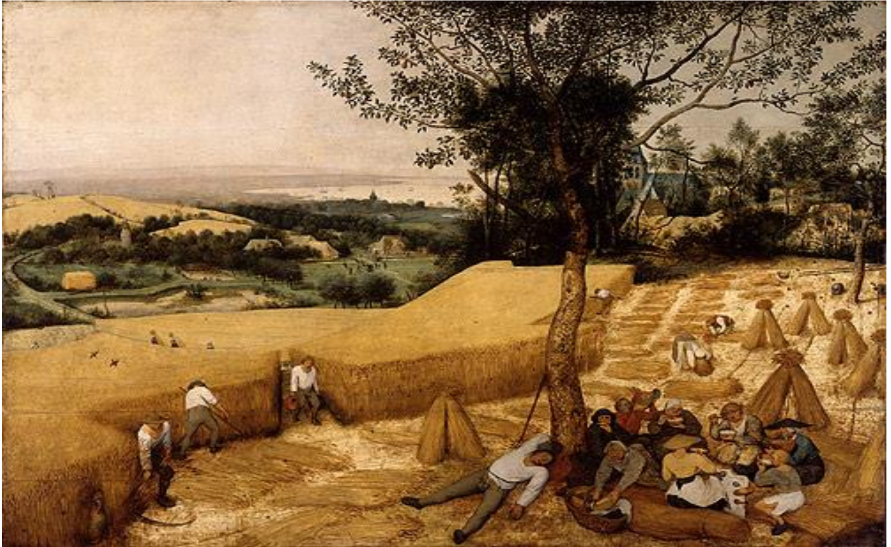
Cereal harvest by scythes in the old past ages