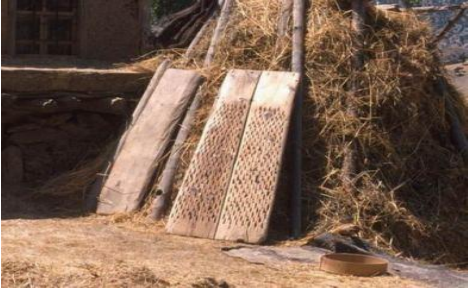
A locally used wooden thresher with blades made flintstones, drawn by animal power(Düven)