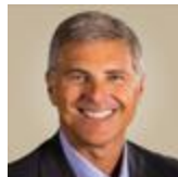
HILTON Christopher J. Nassetta President & CEO