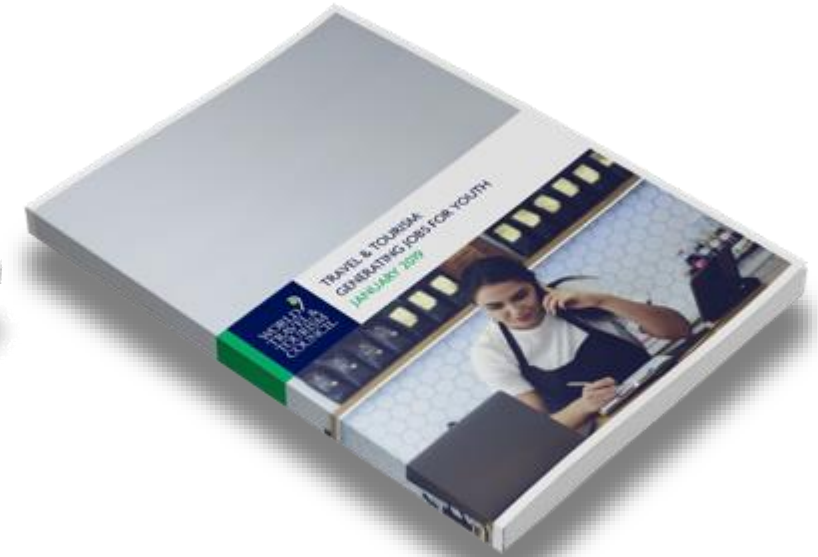
TRAVEL & TOURISM FOCUS RESEARCH