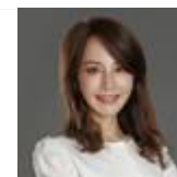
TRIP.COM GROUP Jane Jie Sun CEO