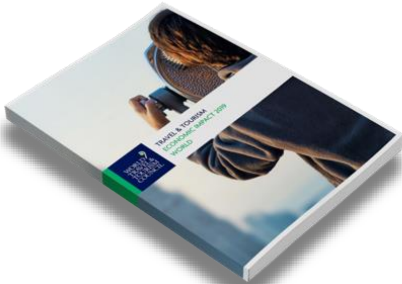
CITY TRAVEL & TOURISM ECONOMIC IMPACT

For over 30 years we have been quantifying the impact of Travel & Tourism in 185 countries in our annual Economic Impact Research .