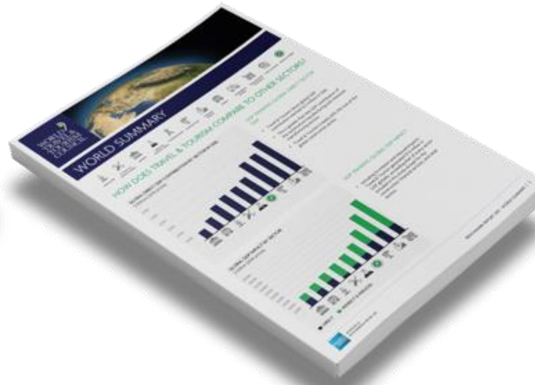
TRAVEL & TOURISM SECTOR BENCHMARKING