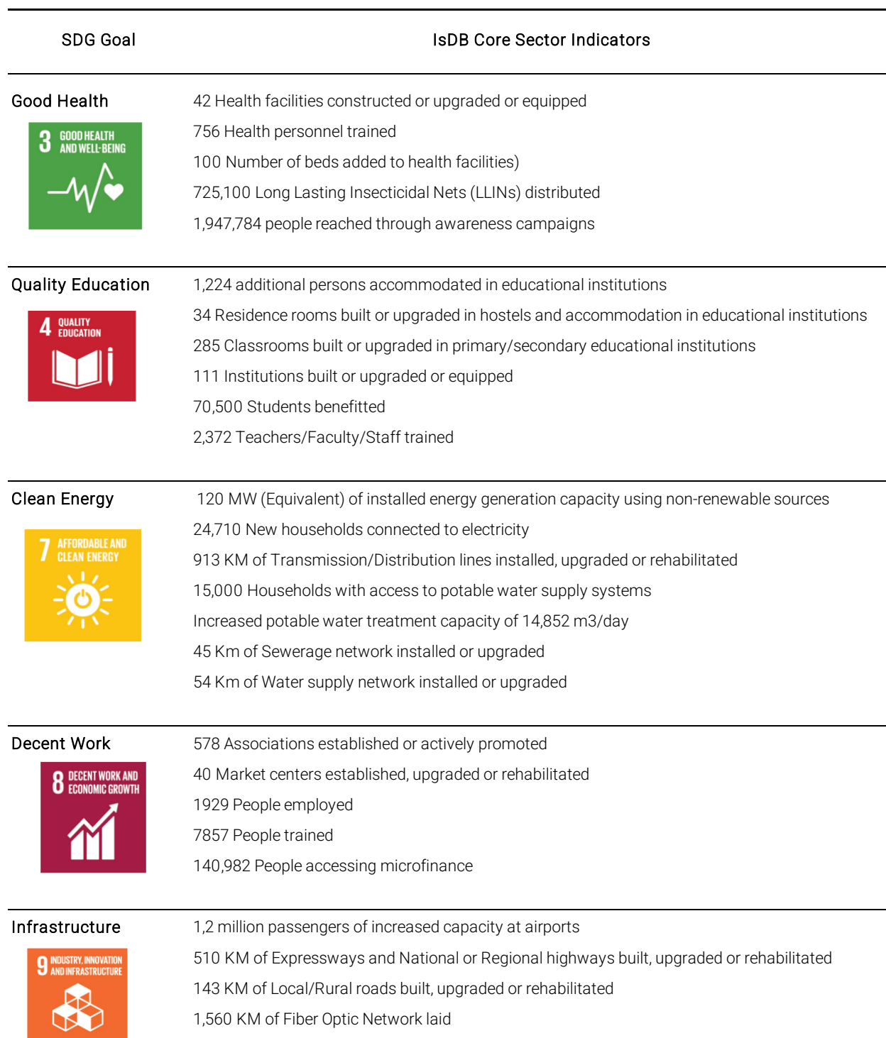
Table 1 - Some additional progress towards the SDGs with SPDA