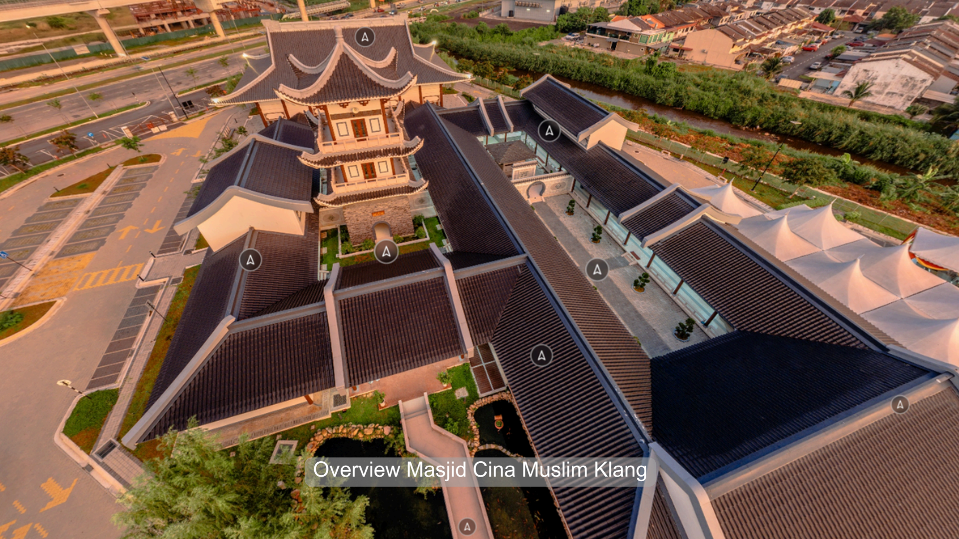
Overview Masjid Cina Muslim Klang